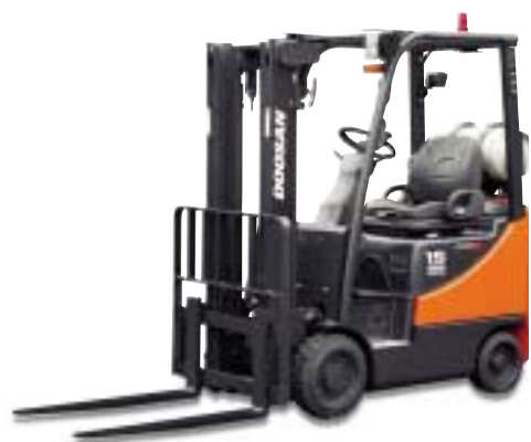
GC15S/GC18S-5 & GC20SC-5 1500kg, 1750kg, 2000kg Cushion Tire