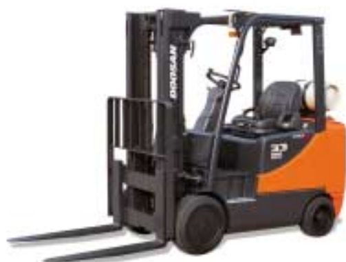
GC20E/GC25E/GC30E/GC33E-5 GC20P/GC25P/GC30P/GC33P-5 2000Kg, 2500kg, 3000kg Cushion Tire