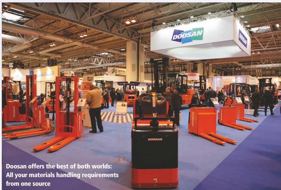
Doosan offers the best of both worlds: All your materials handling requirements from one source

Doosan has launched an online FMS website which allows customers 24/7 access. Each customer is provided with their own login details, enabling them to have complete visibility of their equipment and its history; this new online system allows customers to log breakdowns on a 24/7 basis, monitor uptime and fleet utilisation, request and authorise quotes for repairs, as well as review accounts information. The major benefit here is that our customers can make informed decisions