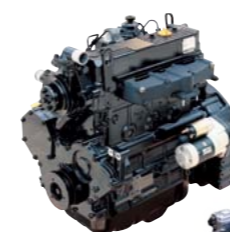
Diesel Engine 4TNE94L